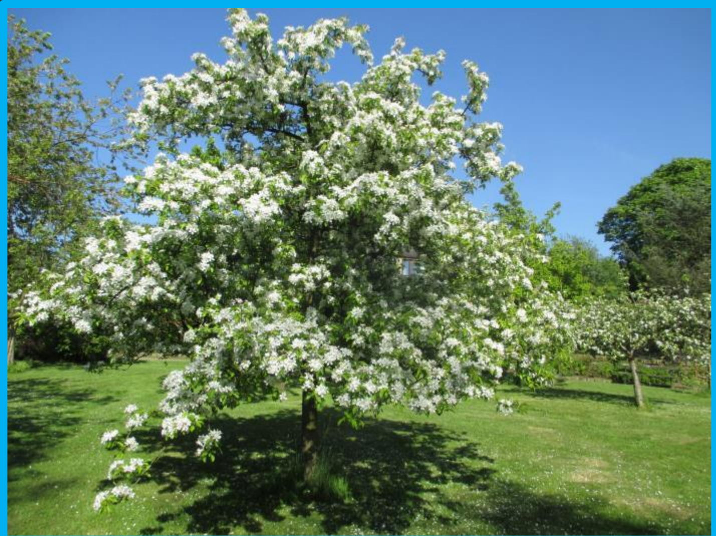
Lower Higham Orchard – May 2018