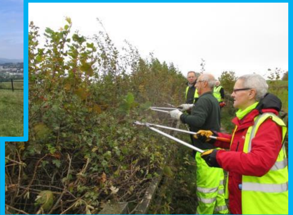
Grass Cutting around the Cenotaph – June 2018 and Hedge Cutting - November 2018