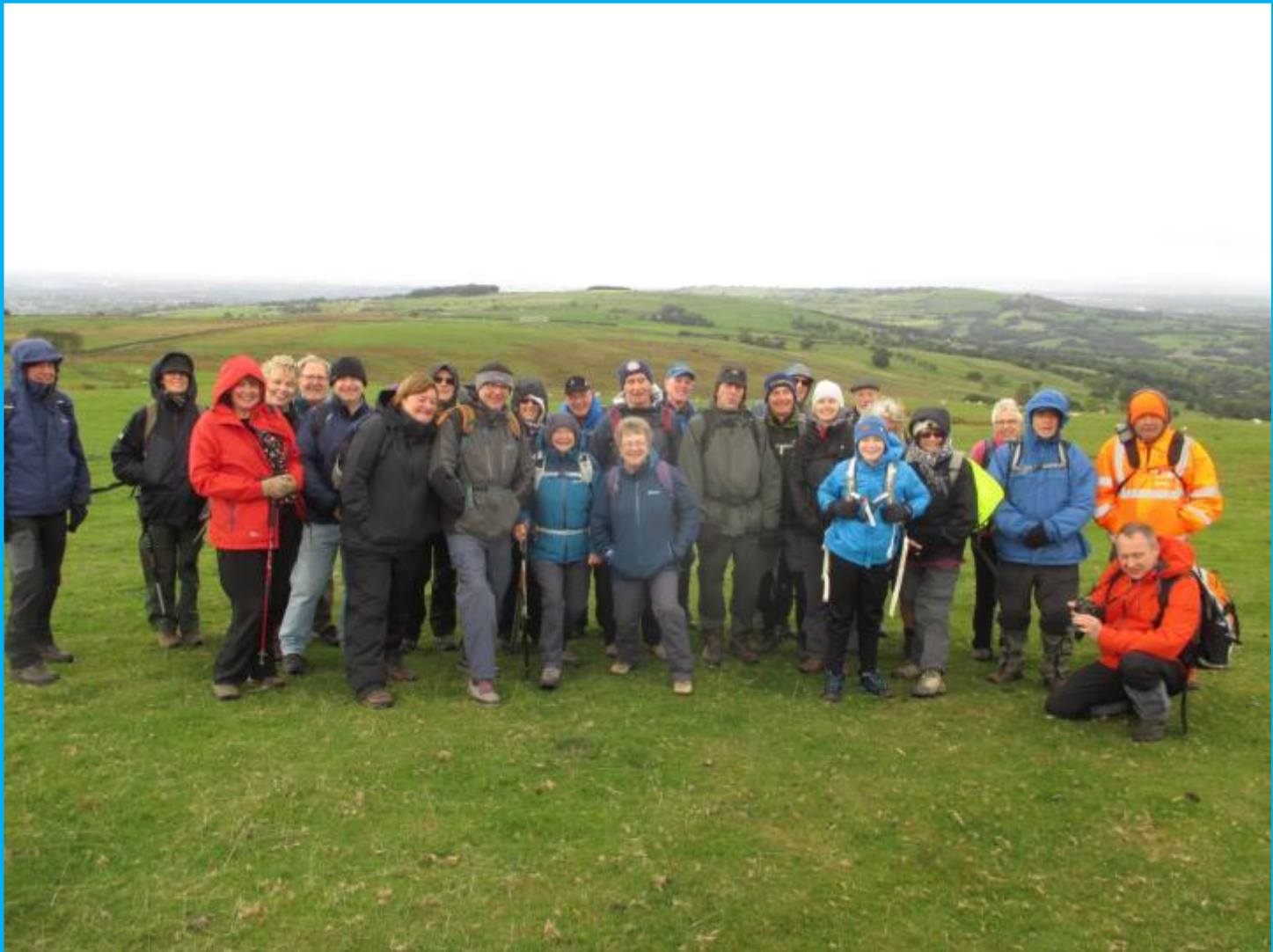
The Cown Edge Ramble September 2018